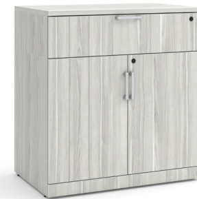
Shown on top of a PL113