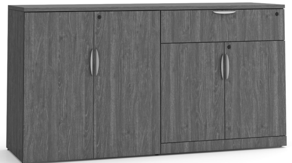
Shown on top of a PL113 next to a PL152.