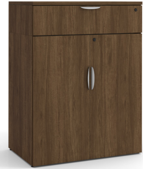
Shown on top of a PL152