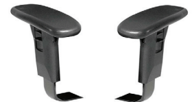
311AK – Optional, Height + Width Adjustable Arm Kit