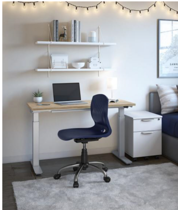
Shown above with aspen finish. PLT tops sold separately.